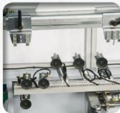
Gruppo ventose Suction cups unit