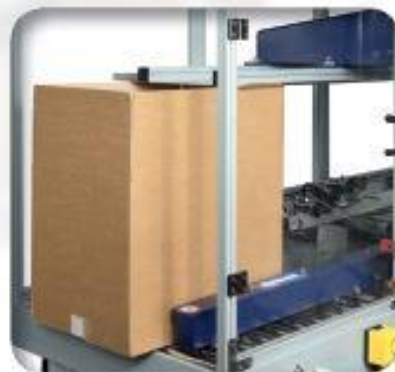
Gruppo nastratura inferiore Bottom taping unit