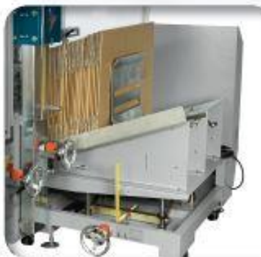
Magazzino cartoni Storage unit