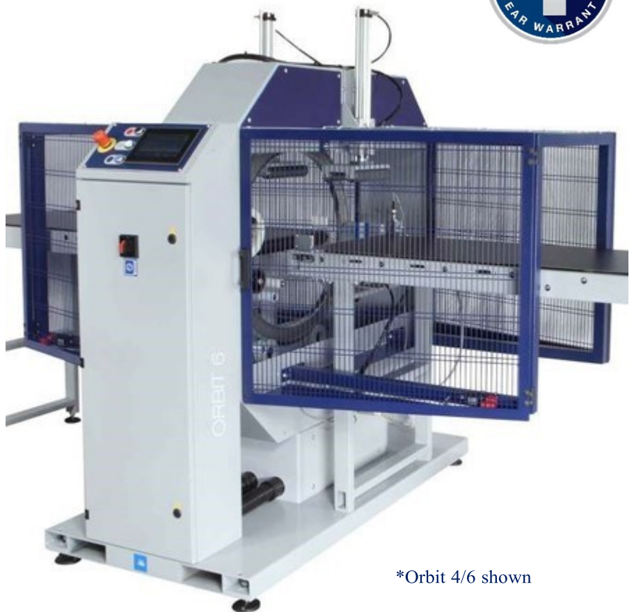
*Orbit 4/6 shown