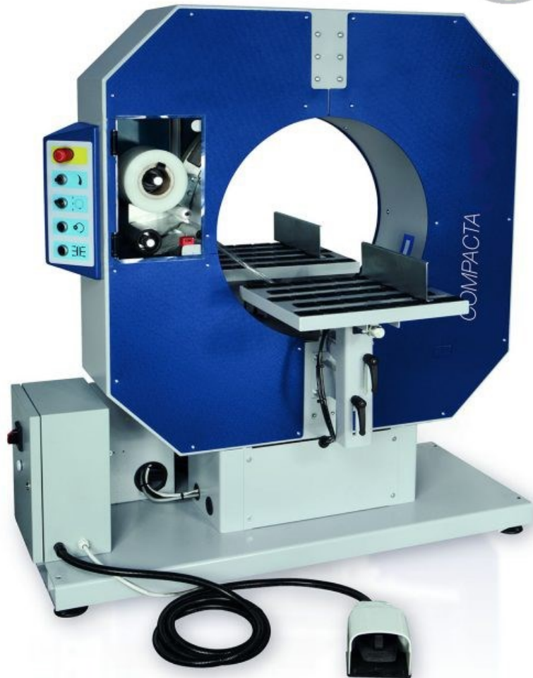
Compacta 4/6 shown

Safe, simple operation includes automatic film clamping and cutting. Compactas feature constant film tensioning to improve package integrity and reduce film breaks.